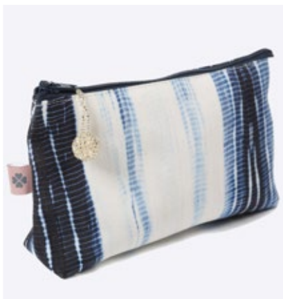
SKU: SPCHMBLUE1 Small Silk purse Mid Blue