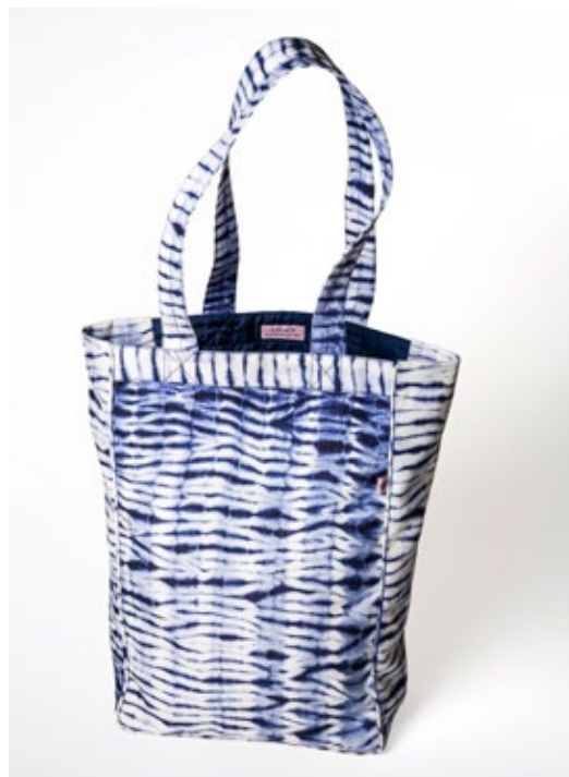
SKU: TOTEBLUE1 Silk Tote Bag Mid Blue