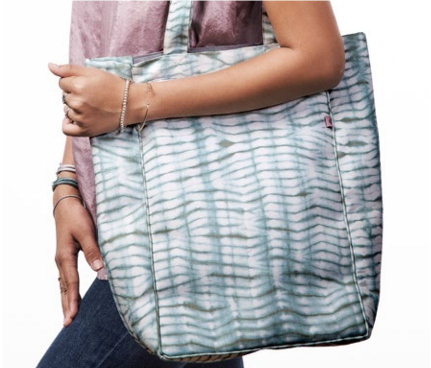
SKU: TOTEGREEN1 Silk Tote Bag Green