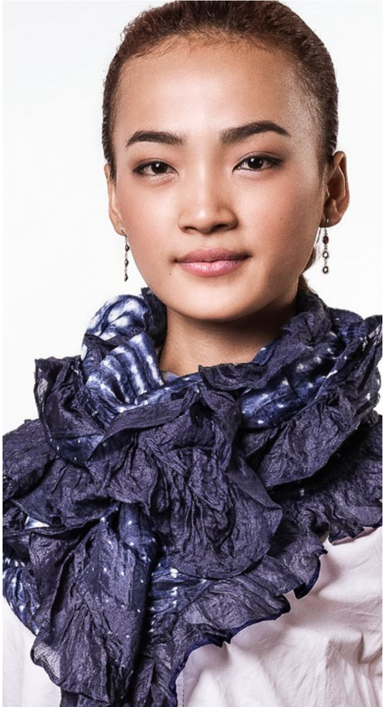
SKU: SRUFMBLUE Shibouri Double-layered triangle with ruffle