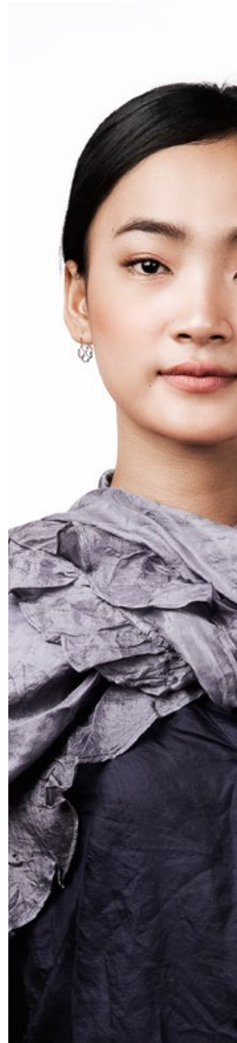
SKU: RUFFP Double-layered triangle with ruffle Pussywillow