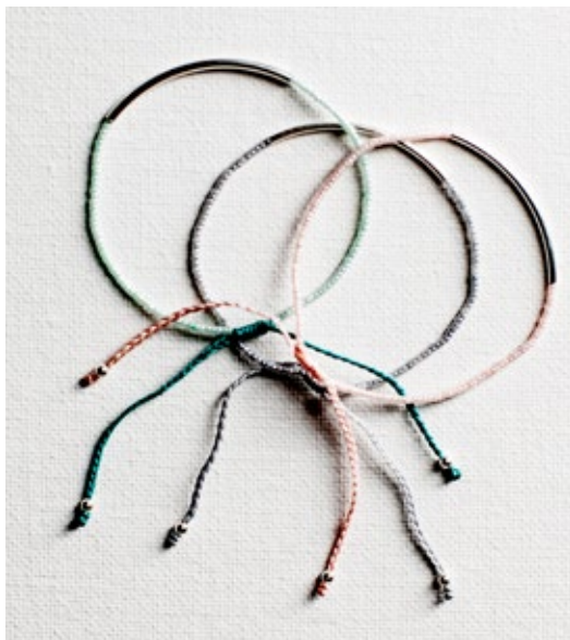
SKU: BEADSILVERTUBEPINK SKU: BEADSILVERTUBEGREEN SKU: BEADSILVERTUBEGREY Tiny beads and silver tube bracelets