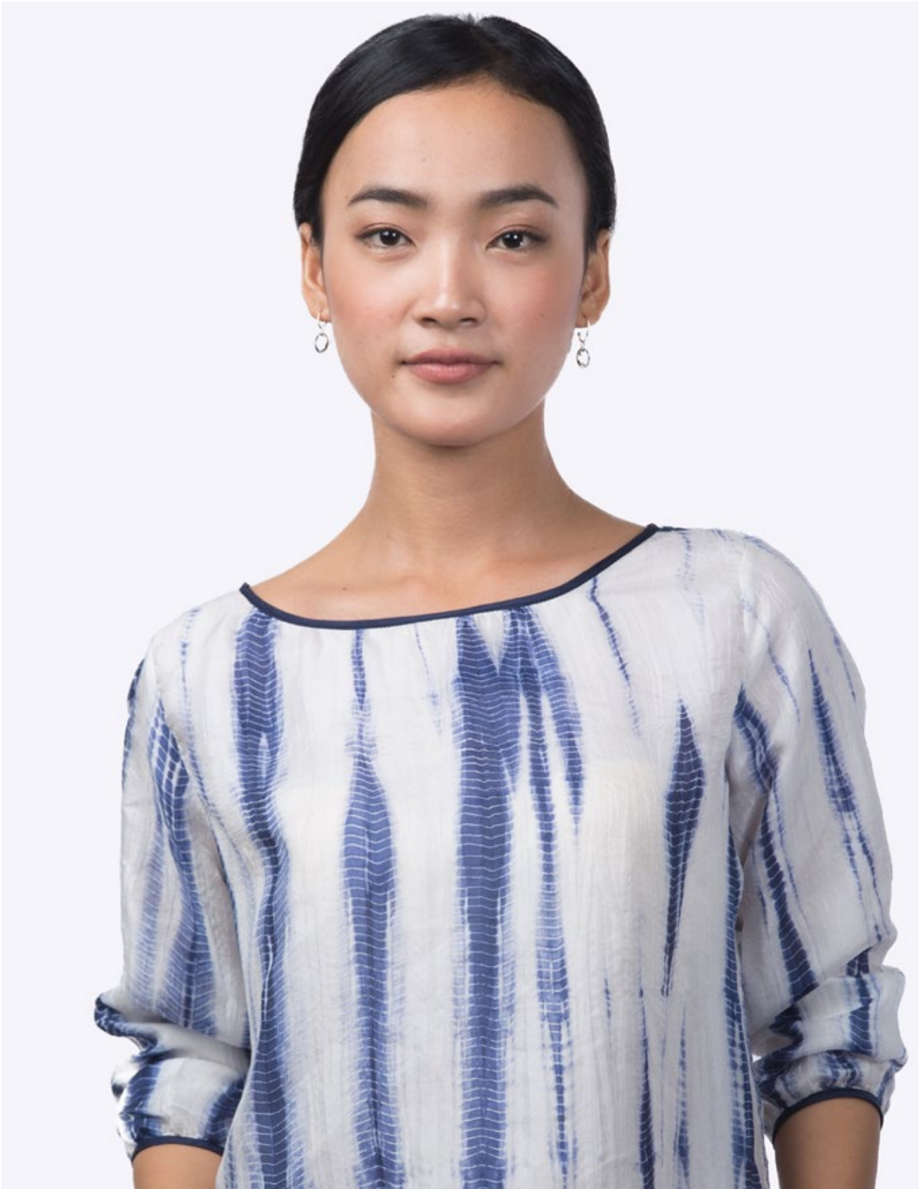
SKU: BOATBLUE Boatneck silk top, hand dyed Mid Blue