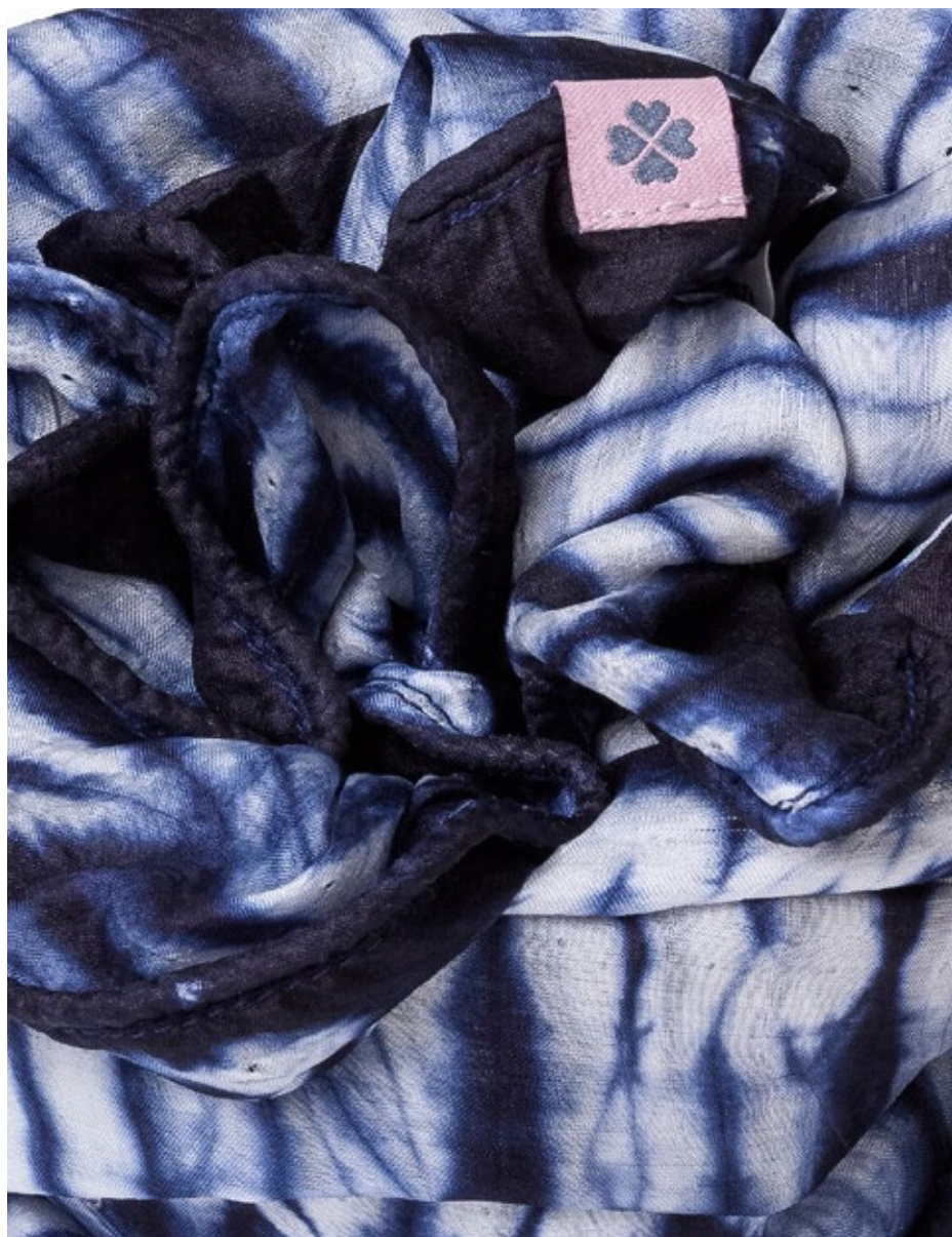
SKU: RPIPBLUE Shibouri Rectangle Double-Layer with piping