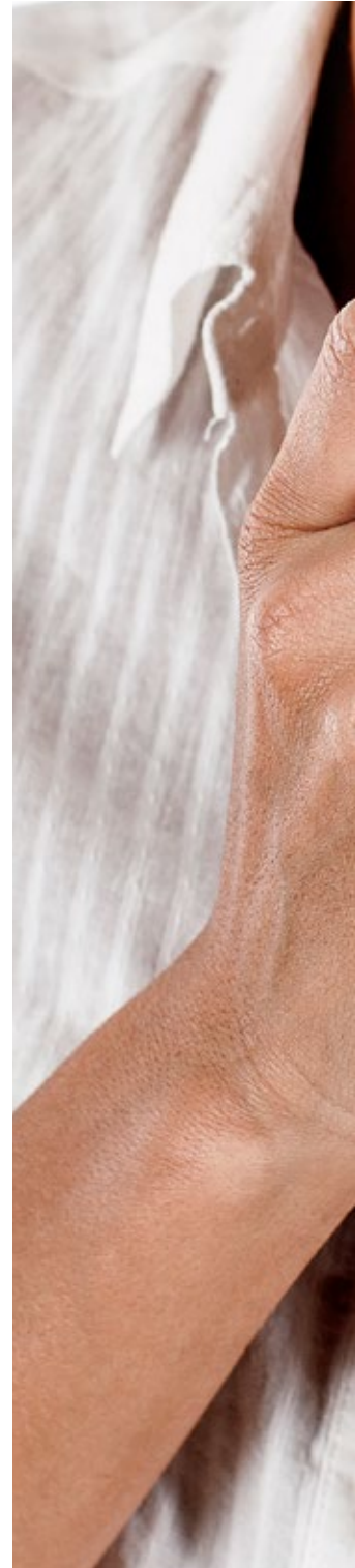
CUSTOM JEWELRY Rose Quartz Earring