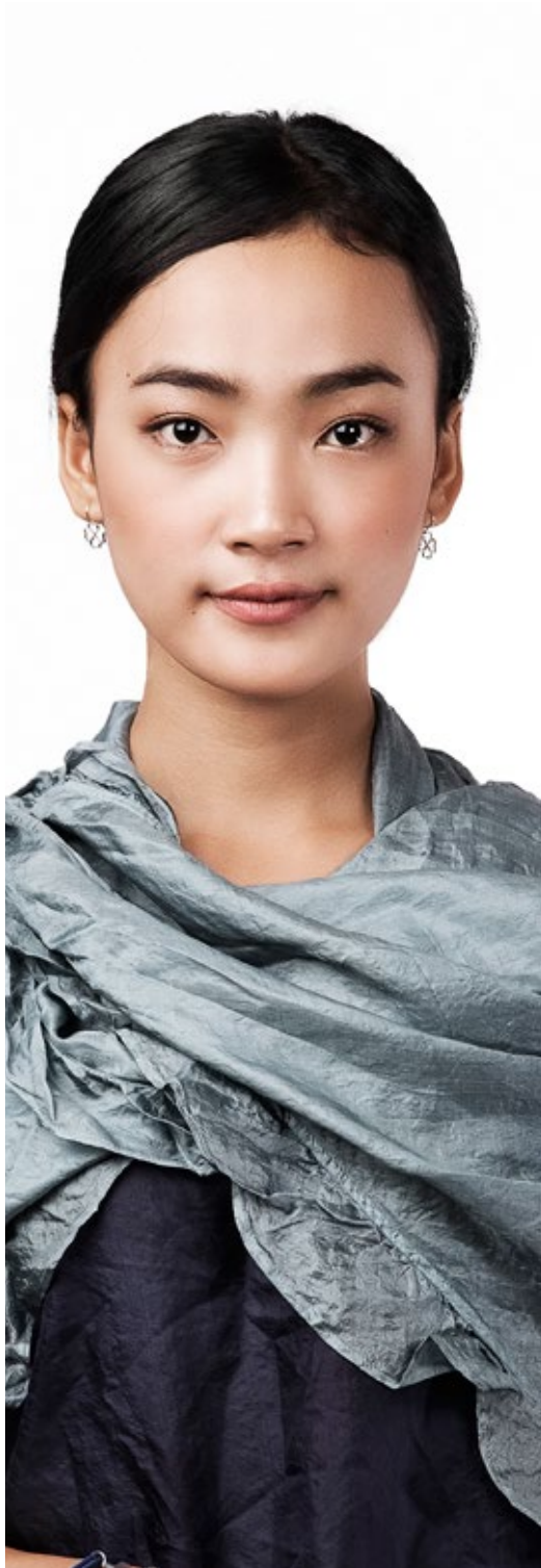
SKU: RUFMISTG Double-layered triangle with ruffle Mist Green