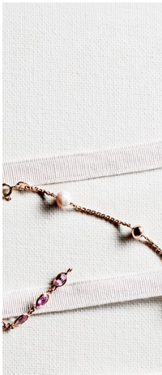
CUSTOM JEWELRY Semi-precious beaded bracelet