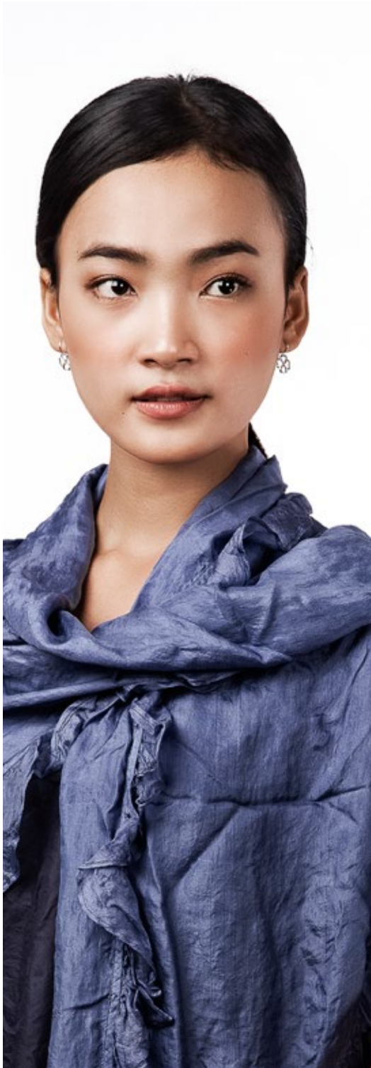
SKU: RUFSAPHIRE Double-layered triangle with ruffle Sapphire