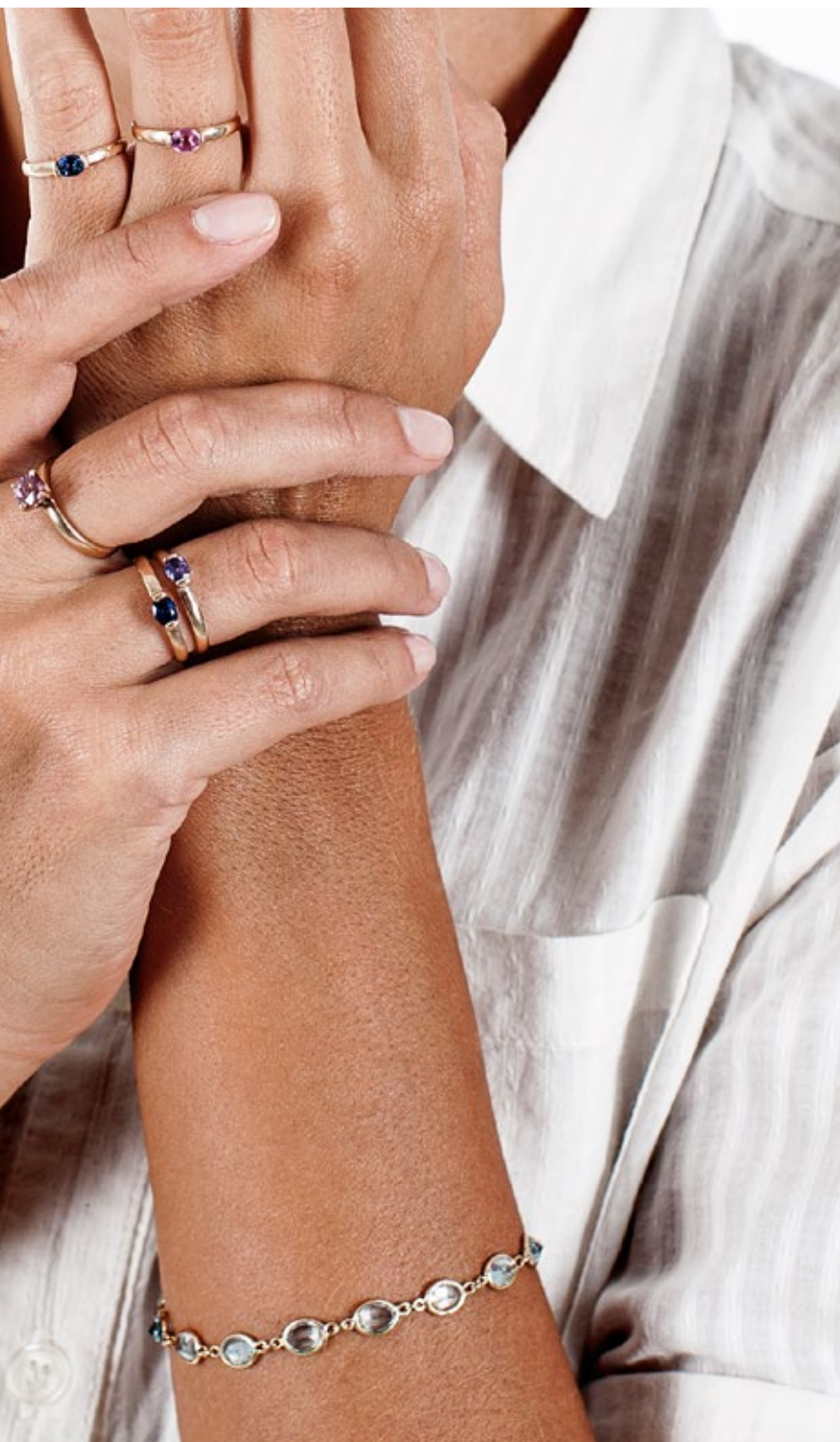
CUSTOM JEWELRY 4Hearts Stacking Rings