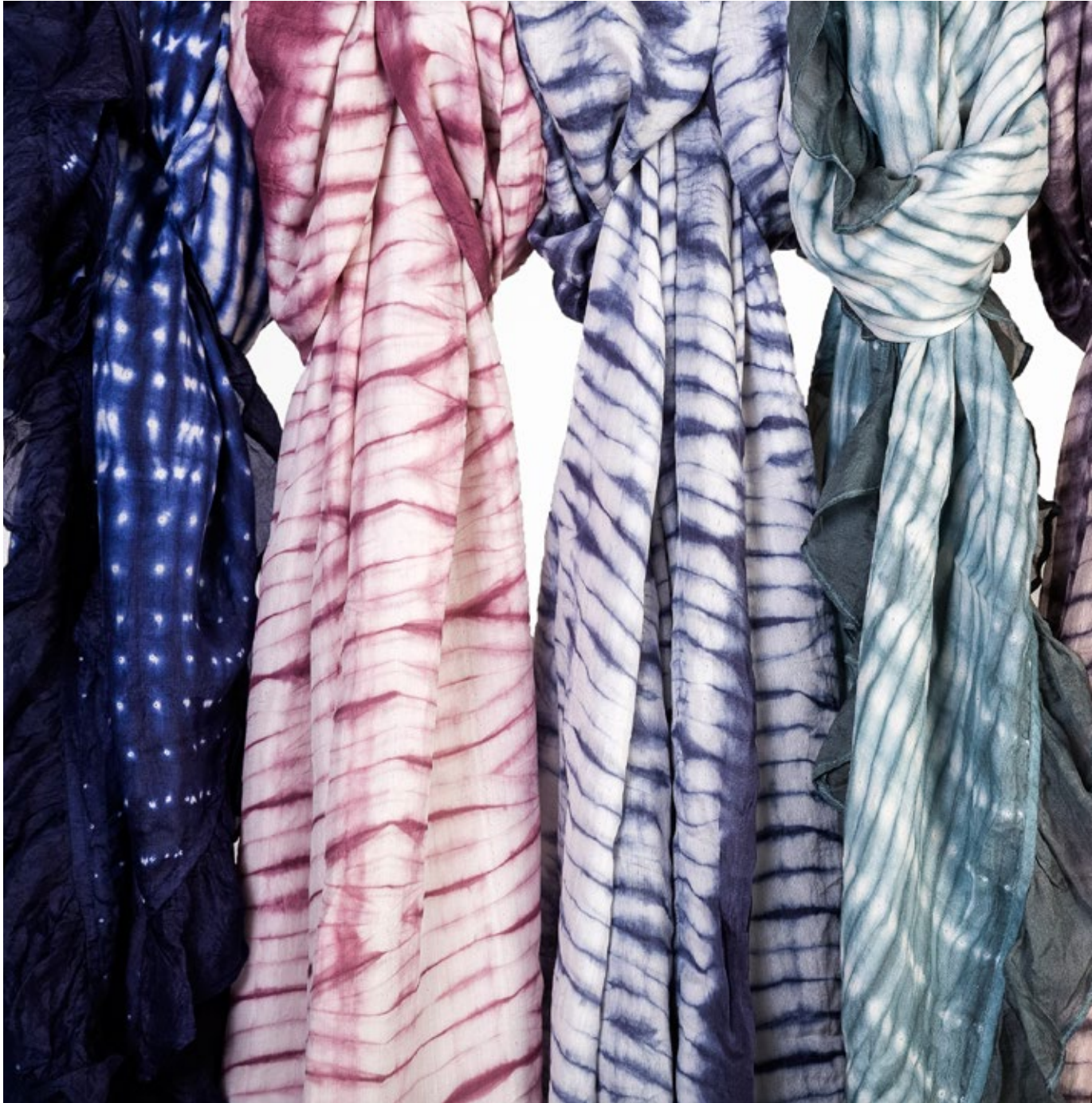
SHIBOURI COLOUR Mid Blue