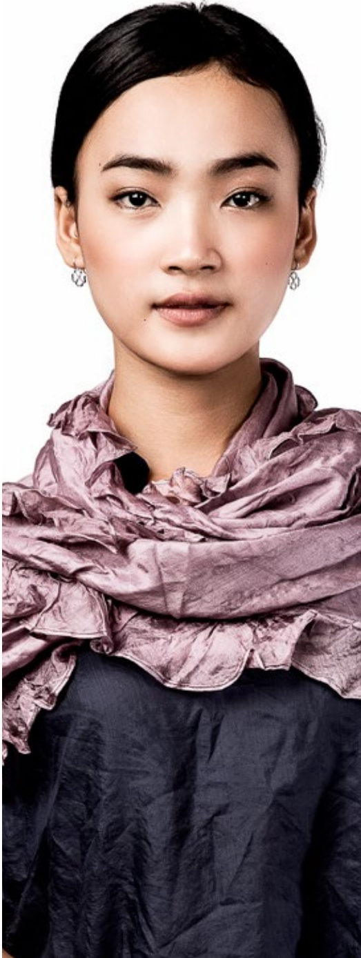
SKU: RUFLAVEN Double-layered triangle with ruffle Lavender