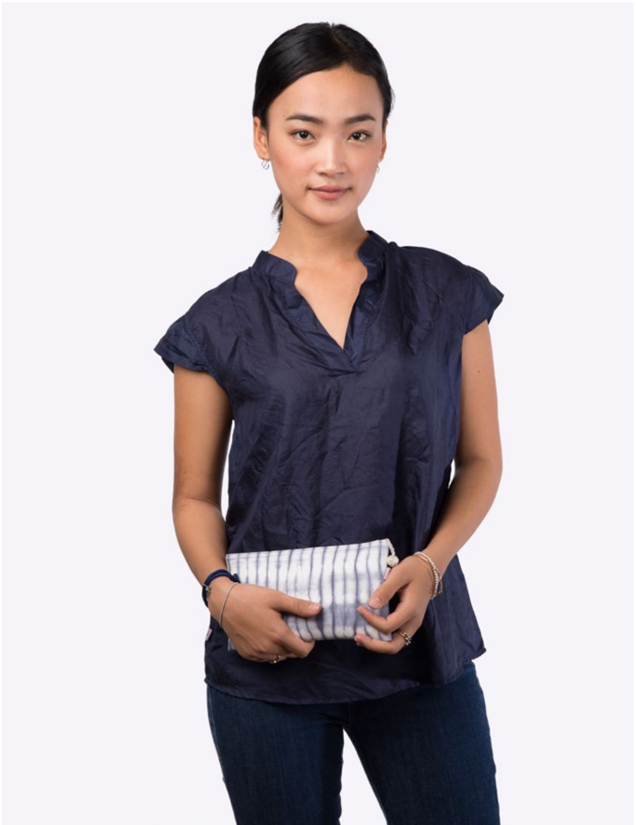
SKU: CAPSMBLUE Capsleeve silk top, hand dyed Mid Blue