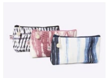
Small Silk purse, lavender , shadow black, mid blue