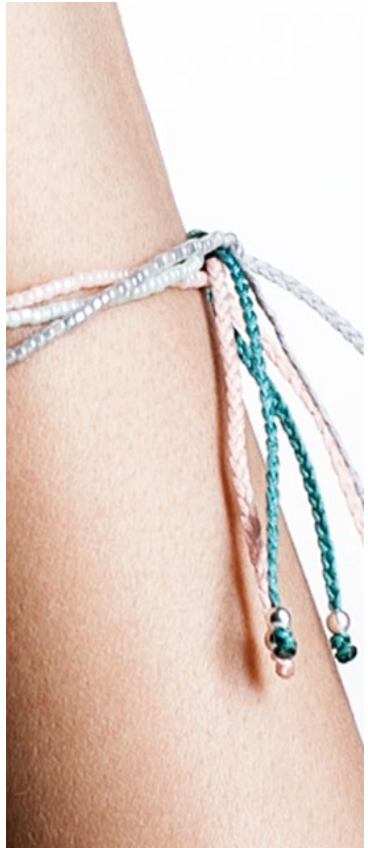
SKU: 4HEARTSEARRINGS Signature Charm Earrings