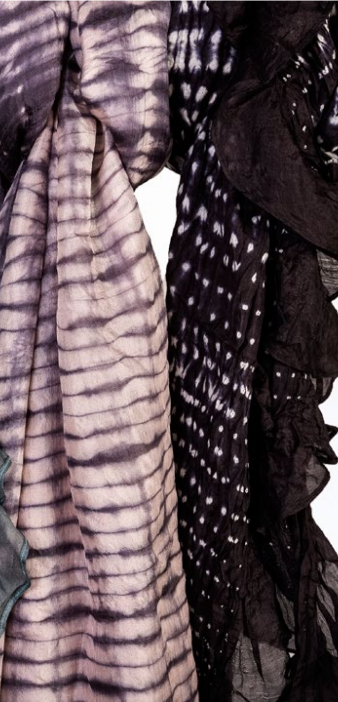
SHIBOURI COLOUR Bitter Choc