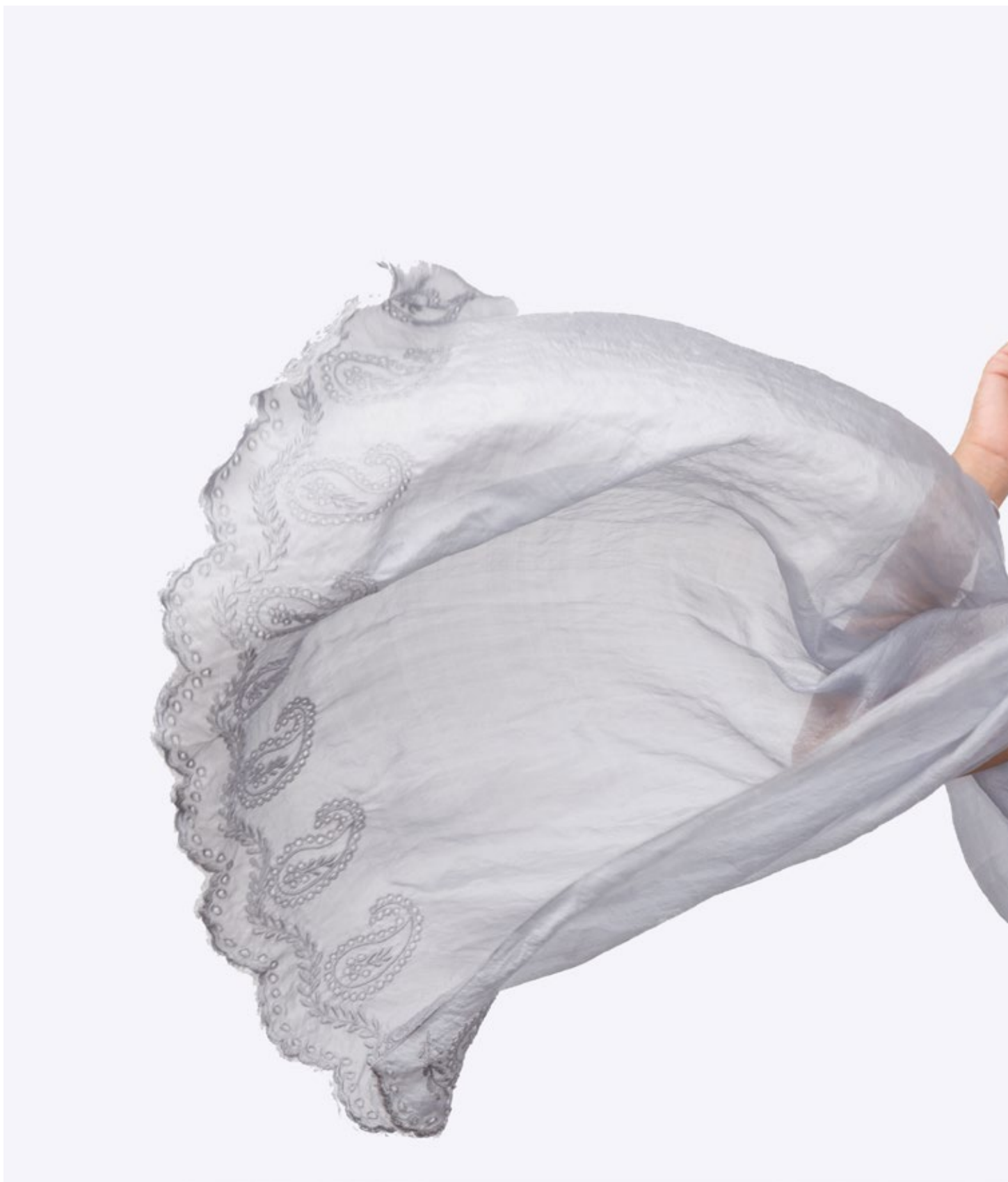
SKU: EMBSILVER Hand Embroidered Scarf Silver