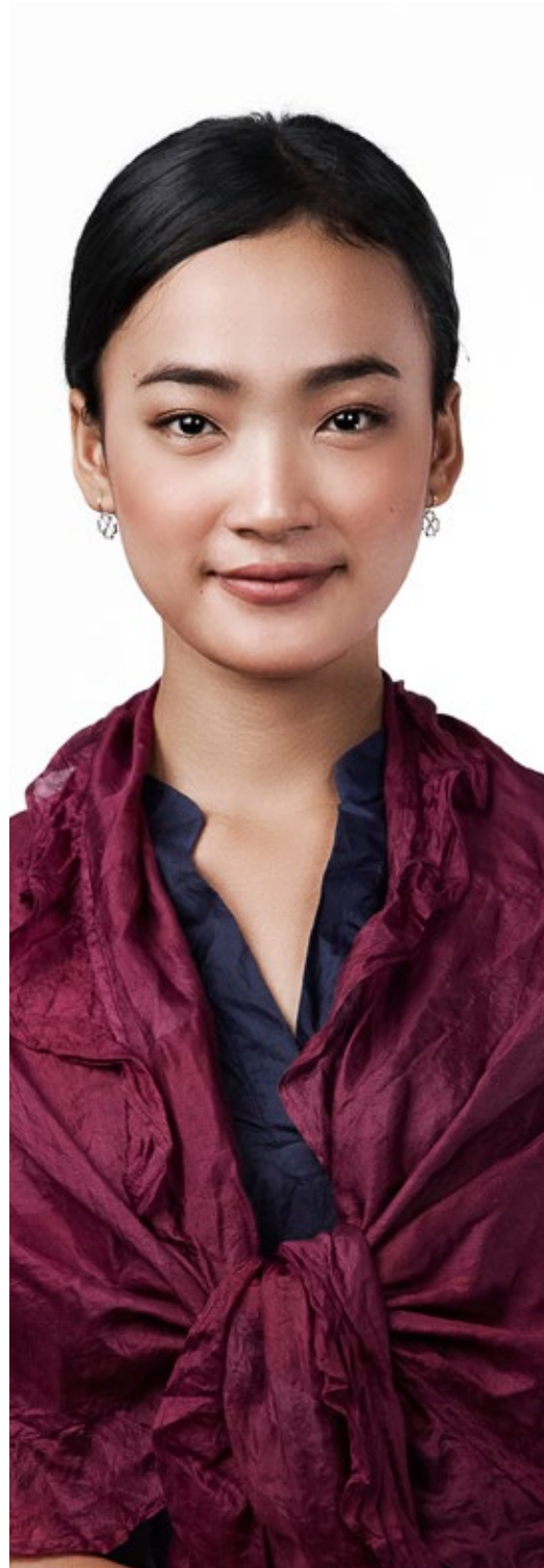
SKU: RUFBORDEAUX Double-layered triangle with ruffle Bordeaux