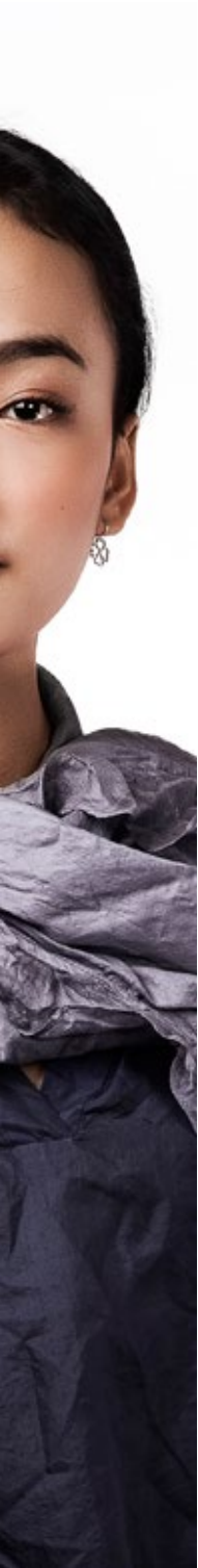
RUSSYW Double-layered triangle with ruffle Dark Grey